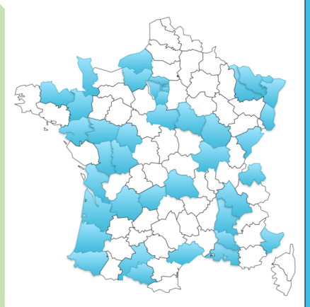
Since 2012, chemsexers who benefit from HAREPO program are present in 40 French departments.

Then 8 % come from Normandie and 8% from PACA, 7 % from Grand Est and 7% from Centre Val de Loire. Finally 5% come from Pays-de-la-Loire 3% from Bretagne, 3 % from Auvergne-Rhône-Alpes, and 2 % from Occitanie.